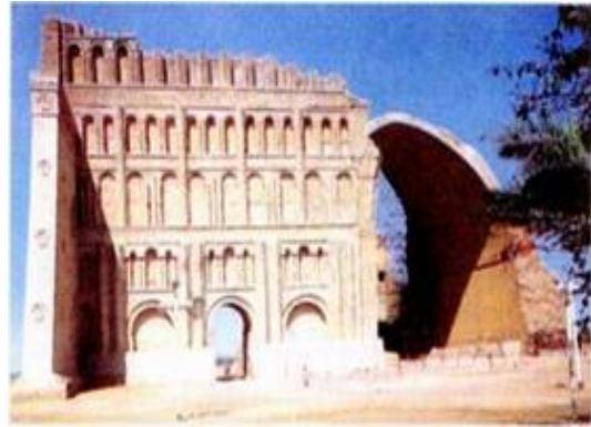
Remains of Persian Palace at Seleucia

According to the document, the Acts of Mari , St. Thaddeus (Addai) had sent his disciple Mari from Edessa to preach to the inhabitants of the royal cities.