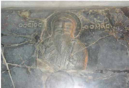
Reliquary of St. Thomas at Ortona

The Assyrian Church of the East began to grow at an enormous pace. By the year 325, the episcopacy of the Assyrian Church—variously known as the ‘Church of Persia’ since it was the only Christian Church within the limes of the Persian Empire—was organized around Papa, the bishop of the royal cities of Seleucia-Ctesiphon. In 410, the first synod of the Persian bishops took place under the presidency of the Catholicos Mar Isaac. It was at this council that the Creed and canons of the Councils of Nicea (325) and Constantinople (381) were received by the Assyrian Church. The Church was by now distributed in all parts