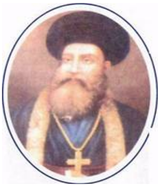
1 st Uniate Chaldean Patriarch John Sulaqa

venerated in this Church. In the Hakkari region of southeastern Turkey were to be found centuries-old churches, and it was here that the Christian Assyrians—for many others of them adopted other religions—found refuge.