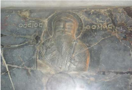
Reliquary of St. Thomas at Ortona