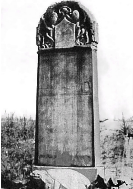
Nestorian Monument of Sian-Fu

on the unity of the Godhead and the humanity in Christ, the Church of the East was branded as 'Nestorian' on account of its refusal to anathematize the patriarch.