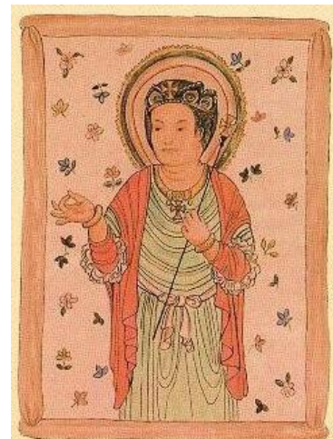
A Mongolian Bishop

The Church enjoyed alternate periods of rest and persecution after the move of the caliphate to Baghdad from Damascus in 752 AD. In around 780, the seat of the patriarch moved to Baghdad, the new capital of the Islamic empire, from Seleucia-Ctesiphon. The monks and clergy of the Assyrian Church served the royal court in the capacities of the court physicians and scribes. Many of the Greek works of philosophy were translated into Arabic by these Nestorian scholars; these works later were translated into Latin and found their way again into the West.