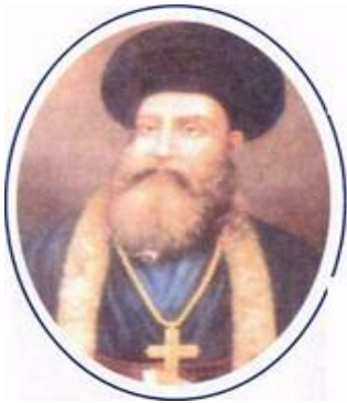
1 st Uniate Chaldean Patriarch John Sulaqa

venerated in this Church. In the Hakkari region of southeastern Turkey were to be found centuries-old churches, and it was here that the Christian Assyrians—for many others of them adopted other religions—found refuge.