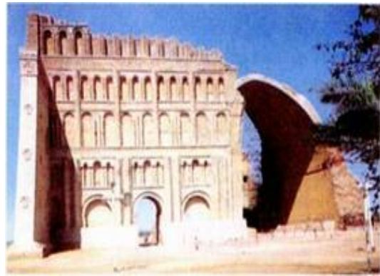
Remains of Persian Palace at Seleucia

According to the document, the Acts of Mari , St. Thaddeus (Addai) had sent his disciple Mari from Edessa to preach to the inhabitants of the royal cities.