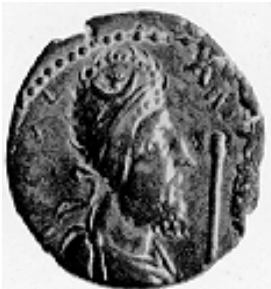
Edessene Coin of Abgar IX

Missionaries from the Holy City of Jerusalem came to preach the Gospel among the Jews in the Diaspora present in Mesopotamia and the Persian Empire. The Acts of the Apostles only records the first Christian missions within the limits of the Roman Empire. Therefore, it is the holy tradition of the Assyrian Church, coupled with historical evidences, that records the spread of the Gospel outside of the limits of the Roman Empire, namely within the Persian Empire—the second superpower of its day.