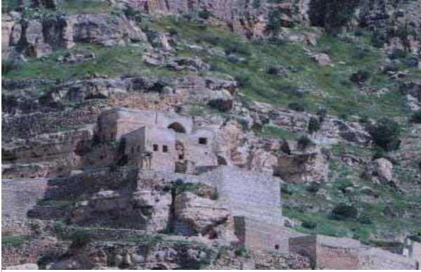
7 th cen. Assyrian monastery of St. Hurmizd at Alqosh

However, Christianity already flourished among the Assyrians of northern